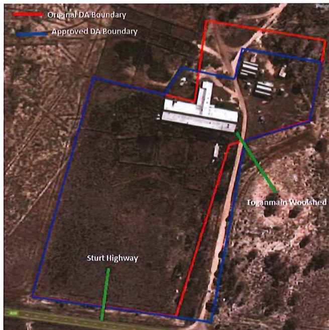
Aerial map of subject site